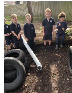
The Junior students for playing on backtrack with the spirit of 'Getting Along'.