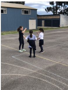
Congratulations to the year 2s who organised and successfully played their own game of Round the World Rock, Paper, Scissors