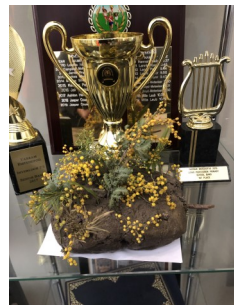
Dae and her friends for making a clay sculpture and so proudly presenting it to me- it's in the trophy cabinet!