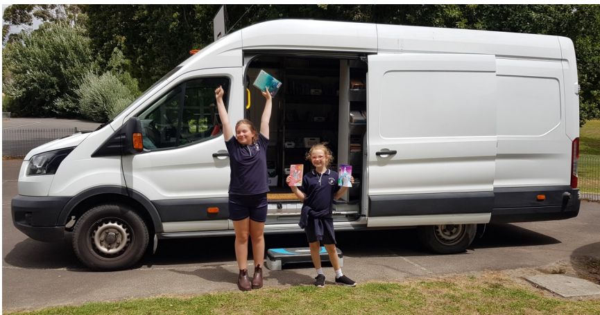
Our new library van