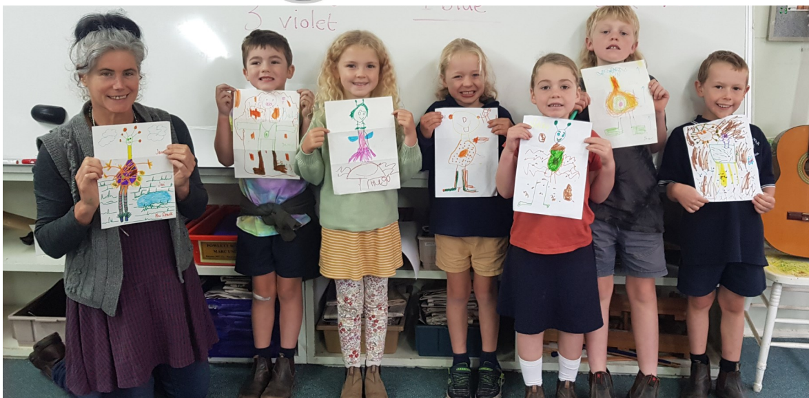
Playing "exquisite corpses".

A surrealist drawing game to encourage collaborative works.