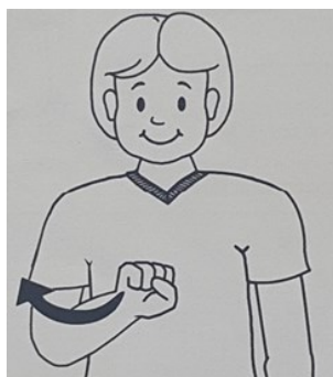
ALL OF YOU