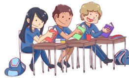
The school earns Scholastic Rewards.