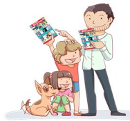
Families order from Book Club.

Every purchase you make earns your child's school 15% of your order value in Scholastic Rewards that can be used to purchase valuable educational resources that benefit your child.