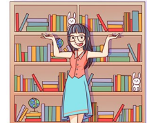
The school redeems Scholastic Rewards for additional resources