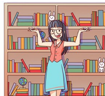
The school redeems Scholastic Rewards for additional resources