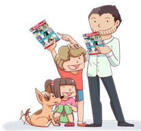
Families order from Book Club.

Every purchase you make earns your child's school 15% of your order value in Scholastic Rewards that can be used to purchase valuable educational resources that benefit your child.