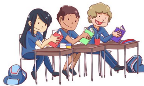
The school earns Scholastic Rewards.