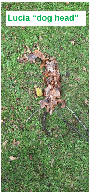
Lucia "dog head"