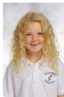
Buley 20th April