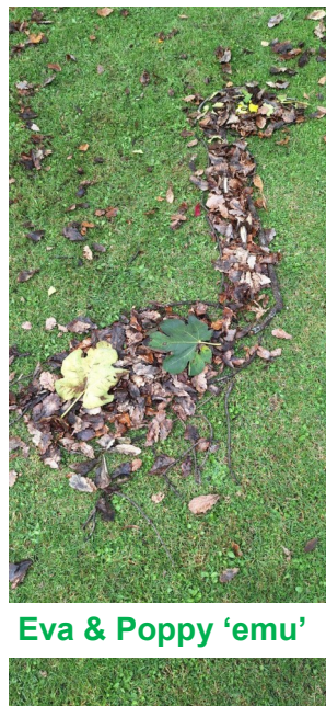
Eva & Poppy 'emu'