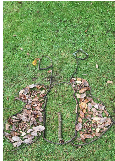
Charlotte & Indi 'butterfly'